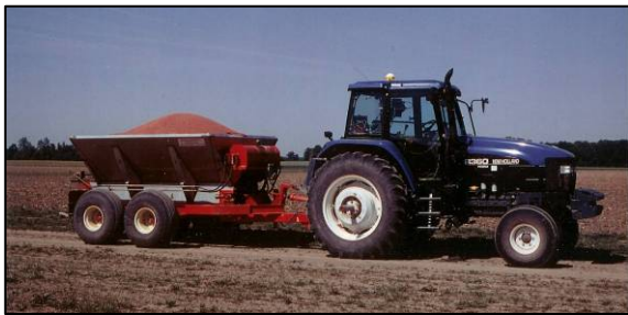
A Chandler spinner spreader with a Mid-Tech controller is used to apply variable rate lime.

To keep field history data, generate plot plans, and implement field treatments the commercially-available software SMS TM Advanced, ArcView, and Farm Works ® are utilized. This geographic information system (GIS) software allows users to store, retrieve, adapt, and manipulate site-specific data from fields. For instance, crop yields or moisture can be correlated with other information collected in the field, such as soil mapping unit or drainage information. High-speed data transmission lines allow for rapid transfer of information to end users on campus or around the state.