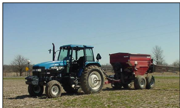
The Rawson Accu-Rate controller enables variable rate applications on planters and with Valmar Airflo ™ fertilizer application equipment (images courtesy DPAC staff).