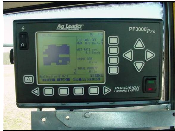
An Ag Leader PF3000 monitor allows not only the collection of yield data but also the use of the monitor for controlling variable rate application equipment