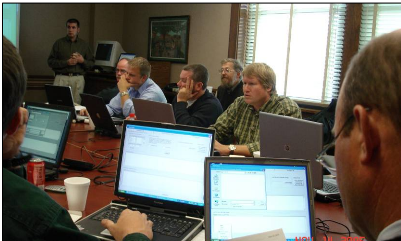
Workshop participants ponder software designed to fix many of the common errors associated with yield monitor data.

One of the key challenges in working with agricultural information is that crop production is a biological system affected by many factors—each of the inputs that a farmer utilizes can have an impact on results, and it is difficult to sort it all out at the