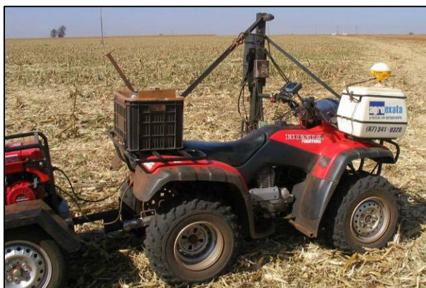
ATM-mounted automated soil sampling equipment used by AgroExata.