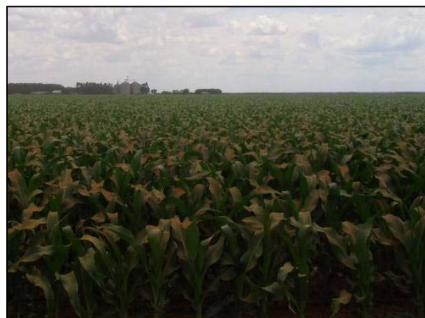
Brazil corn field in December.

Along with soybeans, corn is a significant crop in Brazil. But just as many U.S. farmers favor corn and view soybeans as their rotational crop, many Brazilian farmers consider corn second to soybeans. And whether it is corn, soybeans, or another crop, Brazil will be a formidable competitor long into the future. Brazil currently plants about 150 million acres of annual crops, but an additional 250 million acres of cropland are yet to be opened and farmed.