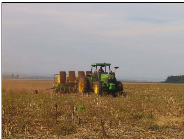
One-third of Brazil crops are no-tilled.